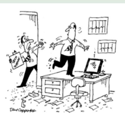
“Hold it! That's not what they mean by 'reboot.'”